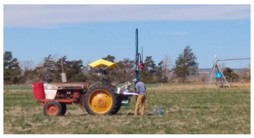
Collecting Soil Samples

Impact: Excessive nitrogen content in treated municipal wastewater that could otherwise be used for agricultural irrigation is a common issue for New Mexico water treatment plants. In addition to being a more environmentally friendly method to dispose of the water, its reuse through low application rate/frequent application irrigation could reduce the amount of inorganic nitrogen fertilizers required to maximize the production of corn and sorghum forage crops.