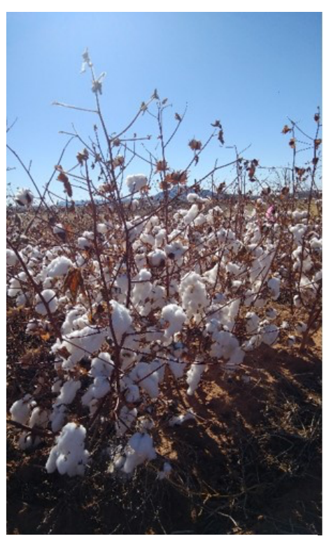
Cotton performance evaluation

Funding Acknowledgement : Entry fees paid for sponsoring companies.