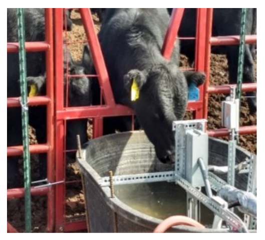
Water Intake Stanchions in Large Growsafe Pen

Funding Acknowledgement : The Tucumcari Feed Efficiency Test, LLC, is the sole provider of funds for this project.