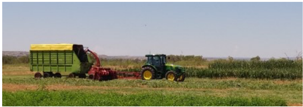
Harvesting sorghum forage performance evaluations

Funding Acknowledgement: Entry fees paid for sponsoring companies.