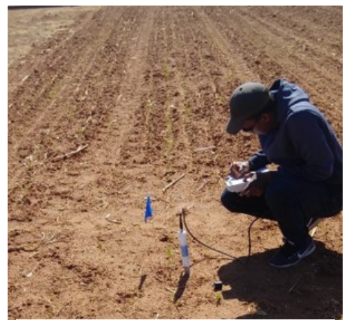
Remote soil moisture measuring

Impact : Excessive phosphorus content in treated municipal wastewater could be a concern in agricultural production and due to environmental impacts. In addition to being a more environmentally friendly method to dispose of the water, its reuse through low application rate/frequent application irrigation could reduce the amount of inorganic phosphors fertilizers required to maximize the production of spring cereal forage crops.