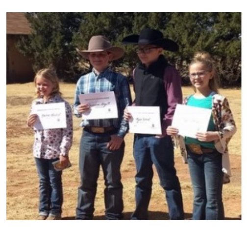
Participants of the NM Youth Feeder Beef Contest

Impact : The positive relationship through the collaboration of TFET and youth programming has resulted in mentoring opportunities for producers to youth interested in the beef industry. It has also exposed young people to some of the technology available in the industry. Participants also learned the value of efficiency in terms of actual feed conversion and cost of gain.