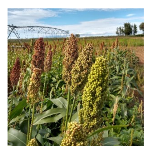
Forage sorghum with lablab to improve nutritive value

major component of protein, to maximize productivity and protein content. Legumes fix nitrogen from the atmosphere and provide it to companion crops. Increasing the protein content of the harvested forage sorghum by planting with a legume could lead to reduced applications of nitrogen fertilizer as well as a reduced need to supplement livestock rations with protein to meet animals' requirements. Research conducted in 2022 indicated that forage sorghum protein was increased when planted with cowpea, lablab, sesbania, or tepary bean compared to monoculture forage sorghum. Growing forage sorghum with cowpea or sesbania increased the land equivalency ratio by 32 or 57%, respectively, compared to growing the sorghum and legumes separately, indicating a yield increase on the same amount of land.