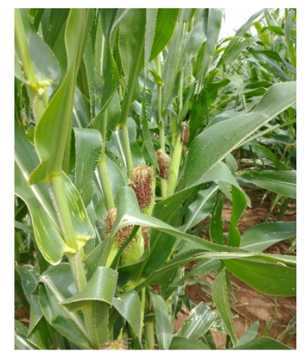
Forage corn performance evaluation

Funding Acknowledgement : Entry fees paid for sponsoring companies.