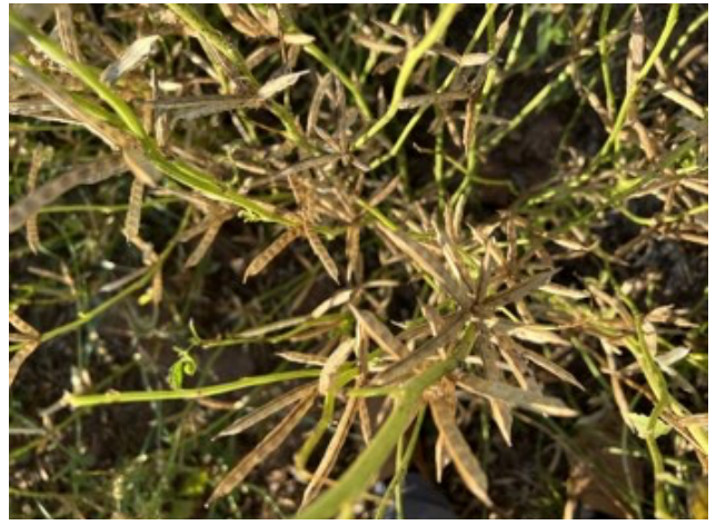
Guar Seed Pods

Funding Acknowledgement : The Sustainable Bioeconomy for Arid Regions (SBAR) Grant-NIFA.